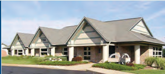
HTSE's 10,000 sq. ft. design facility in Portage, Michigan USA

Envision, engineer, and execute automation projects on time and on budget – project after project.